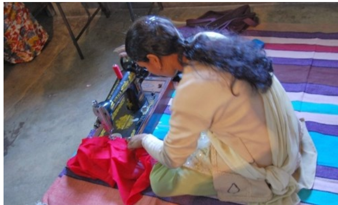
India - local cottage industry production of a bedkit item