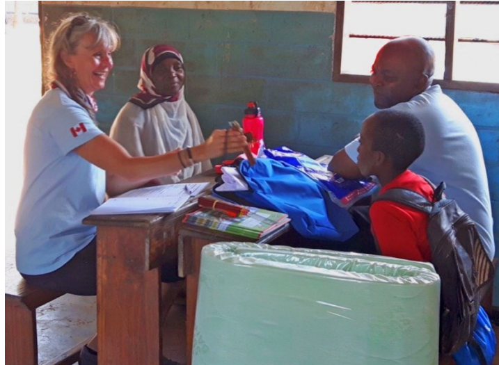
Sleeping Children volunteer talking with a mother, child, and an interpreter