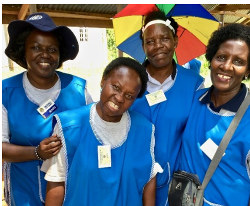
Ladies of the Inner Wheel of Kampala, Sleeping Children's Overseas Volunteer Partner in Uganda